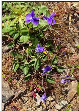
Viola adunca in borrow pit at Point Cabrillo Lightstation State Historic Park