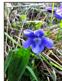
Viola adunca Point Cabrillo Light Station State Historic Park headlands.